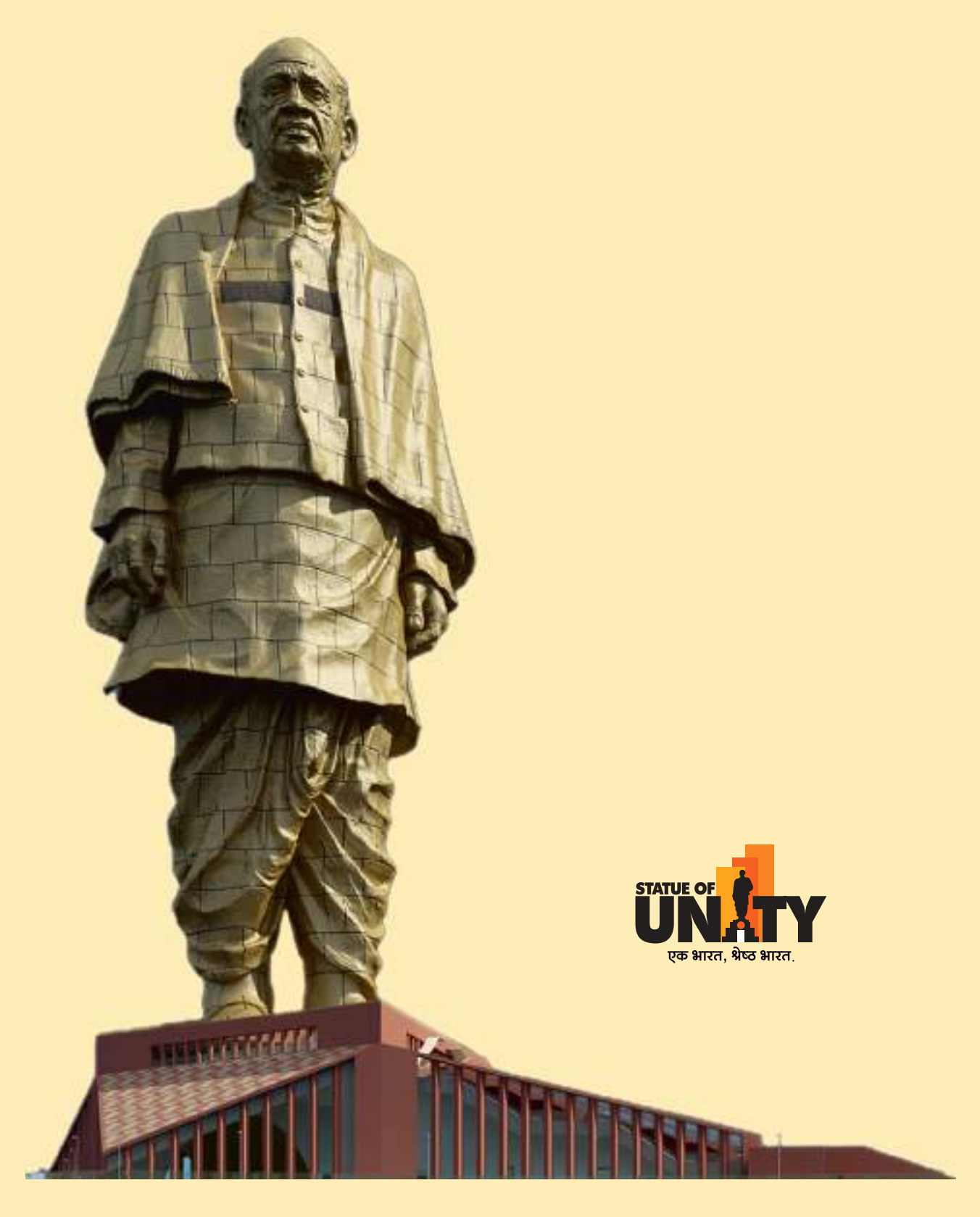
Design, Process & Printed @ Government Central Press, Gandhinagar